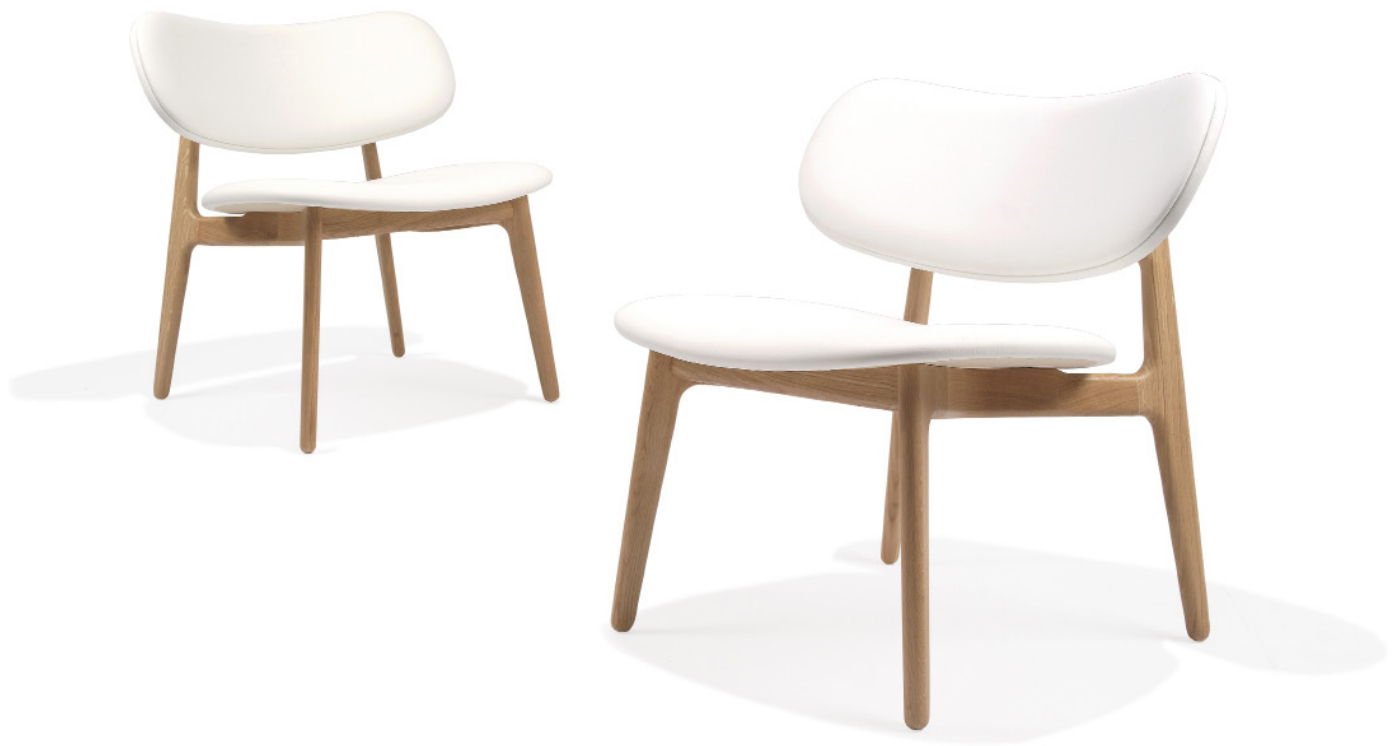
PLC LOUNGE by PearsonLloyd