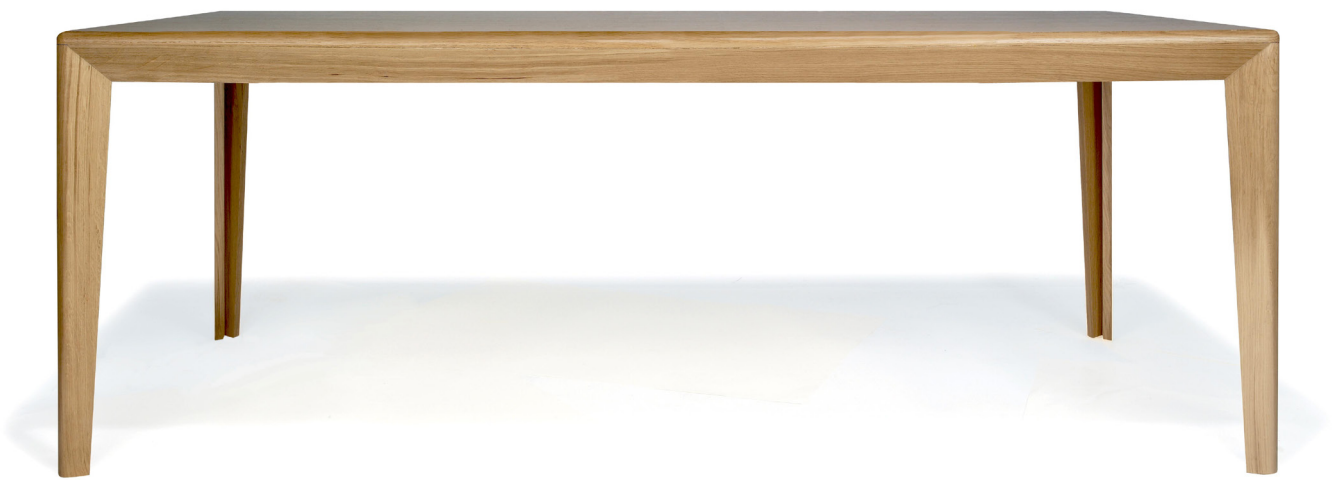
A TABLE by Michael Sodeau